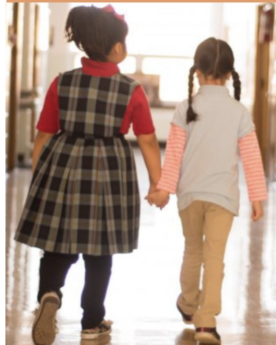
The Catholic Education Foundation tax credit program serves students in 14 regional schools.

Under Kansas law, your company can redirect up to 100 percent of its state corporate income tax liability (up to $500,000) to fund CEF's low-income student scholarships. You will receive a 70% tax credit on your donation.